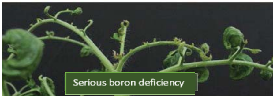
Figure 2. Yellowing and shrinkage of young leaves in tomato plants [top] and the emergence of sudden deaths at growth points [bottom] [Çakmak et al. 2022, unpublished results].

In case of boron deficiency, striking morphological changes and sudden stops in growth in the youngest parts of the plant are also reflected in the growth of all green parts, and the biomass production capacity of the plant generally declines. [Figure 3] In many plant species, root growth is much more affected by boron deficiency stress than the green parts of plants.